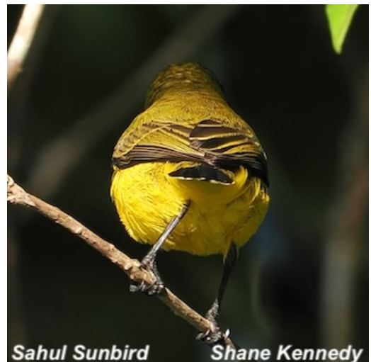
Sahul Sunbird