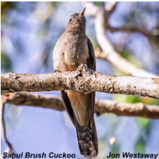
Sahul Brush Cuckoo Jon Westaway