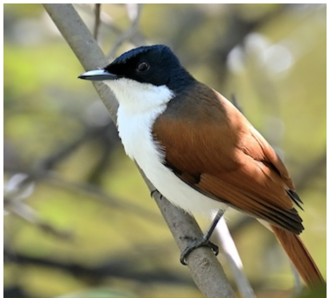
Shining Flycatcher DnN Kelly

Radjah Shelduck, Pacific Black Duck, Australian Brushturkey, Orange-footed Megapode, Peaceful Dove, Rose-crowned Fruit-Dove, Little Bronze-Cuckoo, Sahul Brush Cuckoo, Australian Swiftlet, Bush Stone-curlew, Masked Lapwing, Australasian Darter, Little Pied Cormorant, Australian White Ibis, Great Egret, Osprey, Brown Goshawk, Rainbow Bee-eater, Little Kingfisher, Laughing Kookaburra, Torresian Kingfisher, Sacred Kingfisher, Sulphur-crested Cockatoo, Double-eyed Fig-Parrot, Rainbow Lorikeet, Yellow-spotted