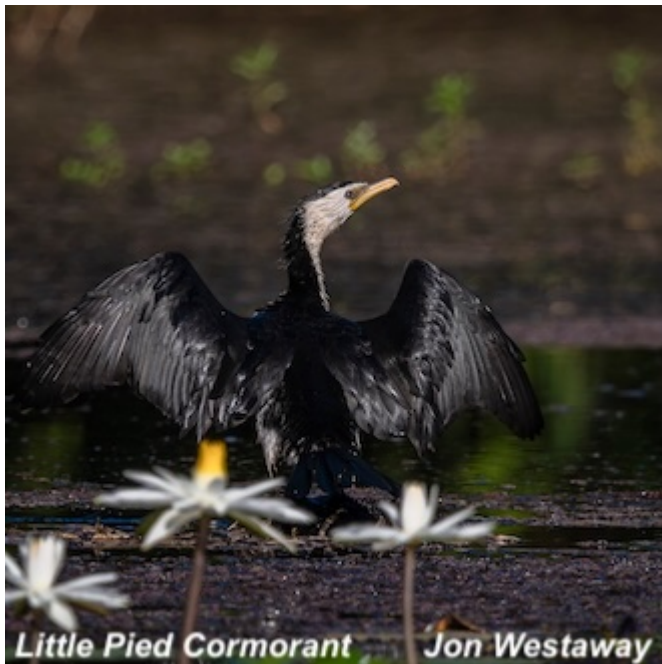
Little Pied Cormorant Jon Westaway

We continued on to the Pagoda, ticking off the Osprey on its nest. Sahul Sunbirds were again busy among the purple bauhinia blooms, creating a beautiful contrast of colours. I was reluctant to move on too quickly as our visitors were thoroughly enjoying these stunning little birds, and that patience paid off when Sean called out, " Little Kingfisher! "