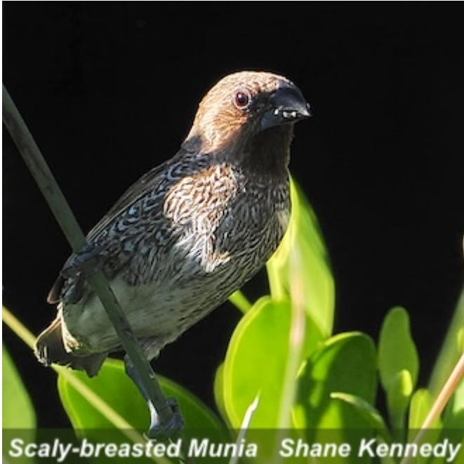
Scaly-breasted Munia

Honeyeater, Yellow Honeyeater, Dusky Honeyeater, Brown Honeyeater, White-throated Honeyeater, Helmeted Friarbird, Large-billed Gerygone, White-bellied Cuckooshrike, Varied Triller, Green aka Yellow Oriole, Australasian Figbird, Black Butcherbird, Willie Wagtail, Australian Rufous Fantail, Spangled Drongo, Australian Spectacled Monarch (Eastern), Magpie-lark, Leaden Flycatcher, Shining Flycatcher, Welcome Swallow, Metallic Starling, Common Myna, Mistletoebird, Sahul Sunbird, Scaly-breasted Munia